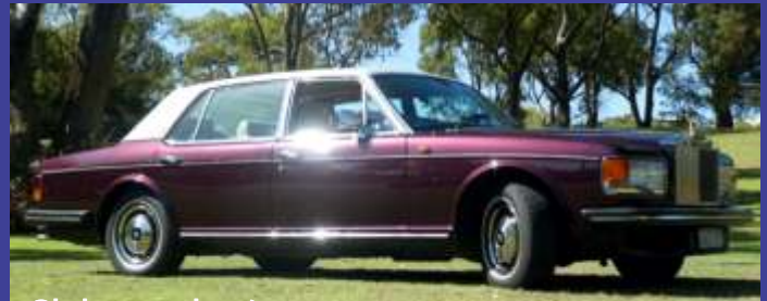
Club member's car