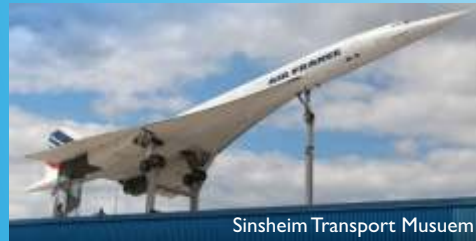
Sinsheim Transport Museum