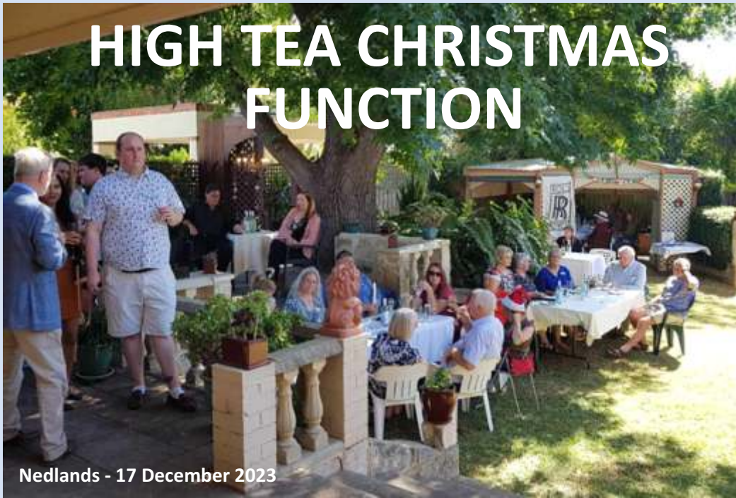
Nedlands - 17 December 2023