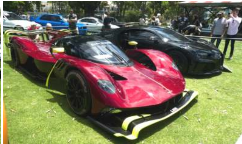
Above: Among the stars of the show were this amazing Aston Martin Valkyrie and the black Bugatti Chiron next to it, with its quad-turbo 16-cylinder engine. The lucky owner has several new Rolls-Royce and Bentley models in his huge collection of exotic cars.