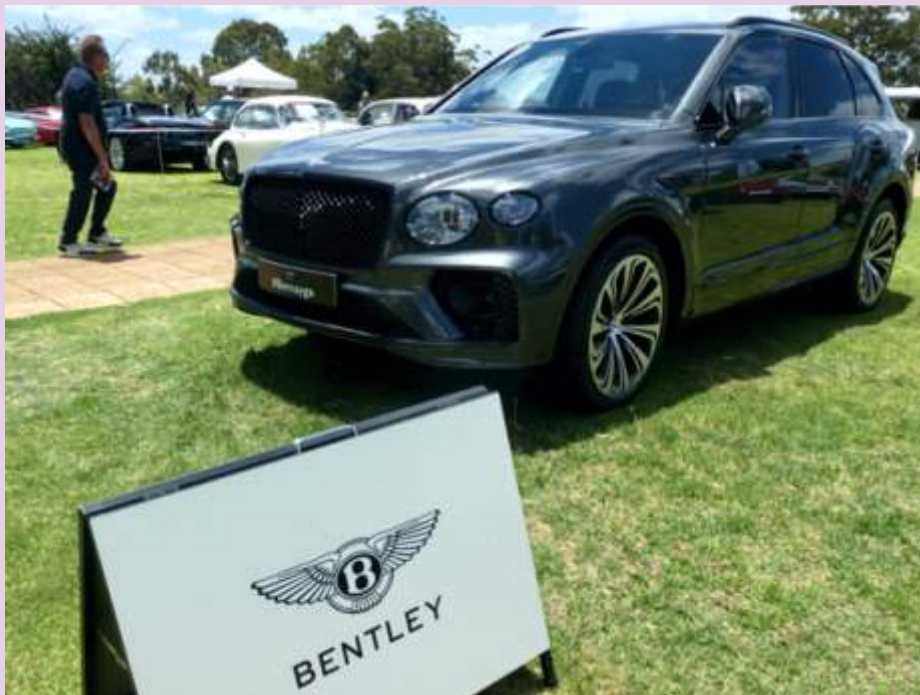
Bentley Perth showed this new Bentayga at the Celebration of the Motorcar.

Planning is advanced for our WA Club Concours to be held on Sunday 14 April 2024 at the Old Observatory in West Perth and we will be putting on a catered lunch costing $55/head. The reason for changing the venue from Guildford to