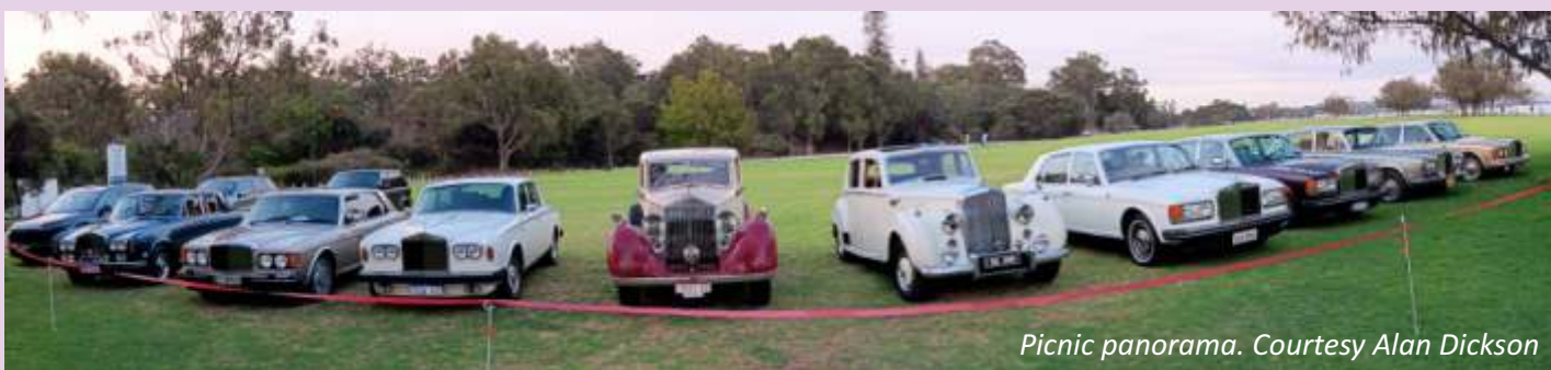
Picnic panorama.

A review of our WA Club Constitution has not progressed. The review is required because of structural changes made to the RROCA Federal Deed at the RROCA Federal Council AGM of March 2023, when all of the Branches of the RROCA became separate independent Clubs.