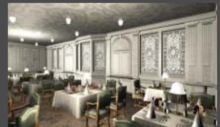
Images of some of the dining rooms